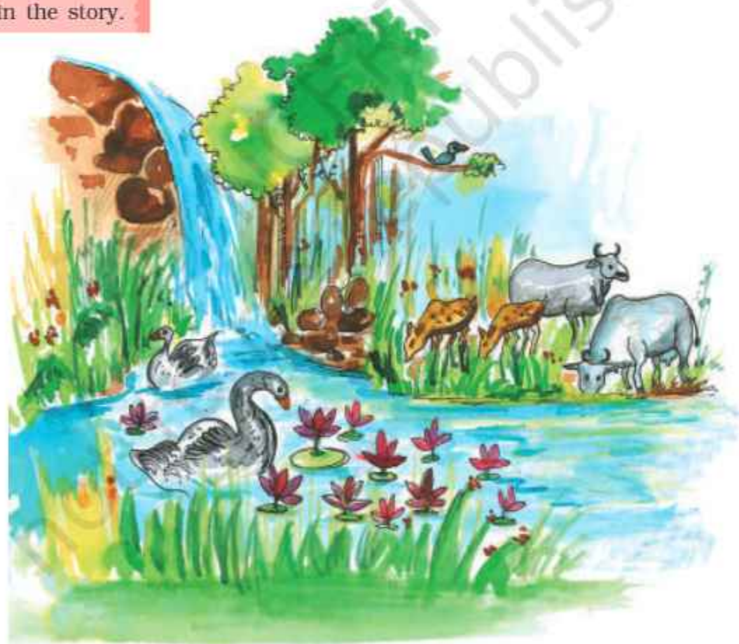
Fig. 1.3: A Pond Ecosystem

Heera from Jaisalmer exclaimed, "We get no rains. We see only 'kikar' and sand, as far as the eyes can see." "But you also find camels", said Ravi.