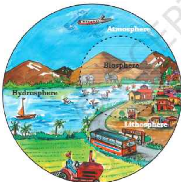
Fig. 1.2: Domains of the Environment

Lithosphere is the domain that provides us forests, grasslands for grazing, land for agriculture and human settlements. It is also a source of mineral wealth.